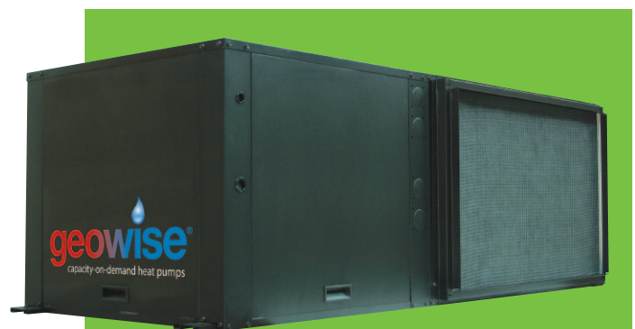
The world's only Capacity-On-Demand heat pumps by GeoWise® contributed greatly to the school's net-zero-energy rating. These unique heat pumps use less than half the energy required by other leading competitive brands.

What happens if any one of the elements of the system is overlooked? Years ago, I explored a career in auto mechanics and took a course in rebuilding engines. I had a Pontiac LeMans at the time and decided to blueprint the engine as my project. Each moving part was machined to precise tolerances and meticulously balanced. The valves were machined and special rollers with heavy springs were used. An Iskey ¾ racing cam, along with a racing distributor and coil, punched up the power. The intake and exhaust ports were ground and polished. When the engine was put back in the car, I expected a great increase in performance, but for some reason, it just didn't seem to perform as I thought it would. I ended up going back to college, abandoning the idea of being a mechanic, and selling my project to a close friend. He took the single-barrel carburetor off and put on a Holly four-barrel. He told me stories of pulling up next to some really hot cars and "blowing their doors off" with the tame-looking LeMans. All the difficult and expensive work I did was stymied by overlooking just one item!