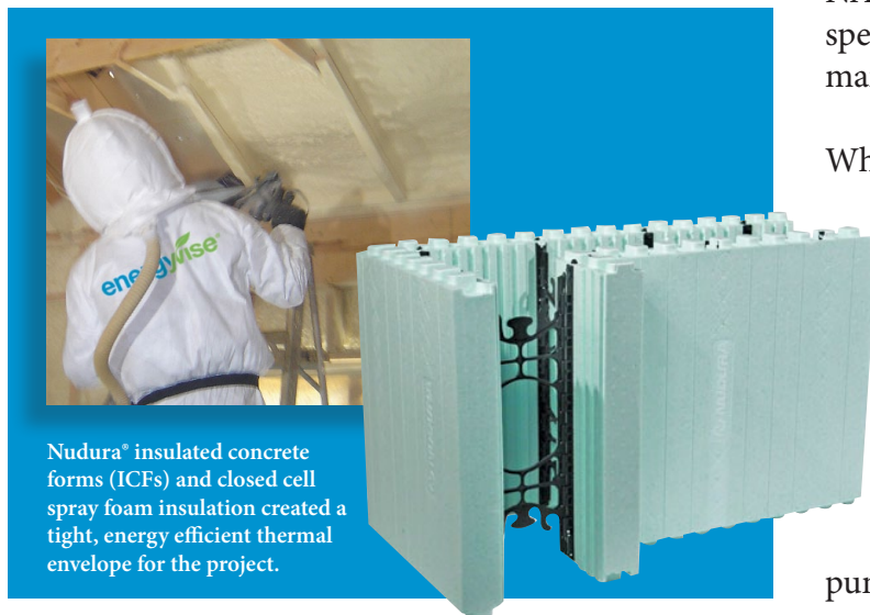
Nudura® insulated concrete forms (ICFs) and closed cell spray foam insulation created a tight, energy efficient thermal envelope for the project.

designed with a very good thermal envelope using foam insulation that minimized the effects of all three forms of heat transfer: convection, conduction and radiation.